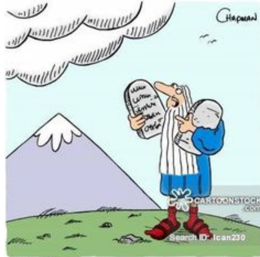
"But there's not enough space for Thou shalt not wear socks with sandals."